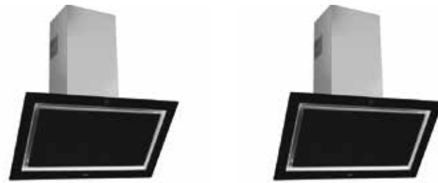
WISH QUADRO DLV 998

THE QUIETEST HOOD, WITH THE LOWEST CONSUMPTION AND VERY EASY TO CLEAN.